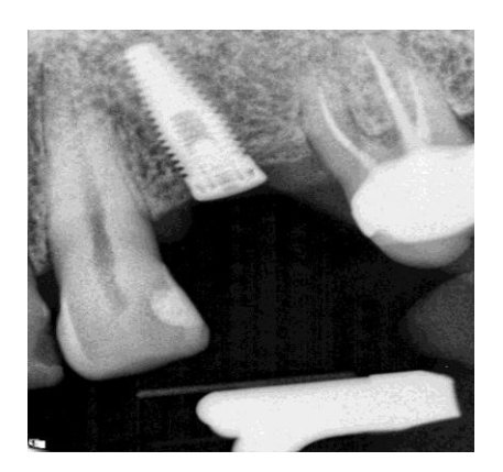
Titanium implant placed into newly formed bone for dental prosthesis attachment.