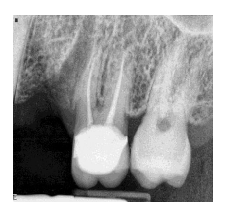
Figure 2. Patient with extraction socket following 1st molar extraction .