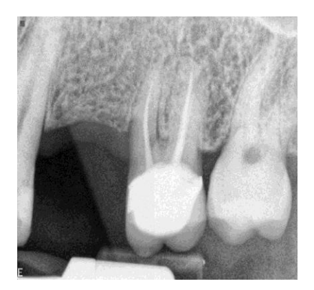
4 months after treatment with DBMXtra, showing ossification, ridge preservation & increased bone density.